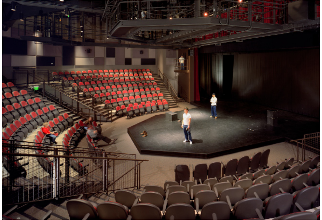
Students rehearse on one of the stages inside the new UCA.

Theater students now have constant access to ensemble and performance libraries, two acting labs, a Computer-Aided Design (CAD) lab, costume and scenic shops and storage. Dancers have three studios totaling more than 6,500 square feet, 36 soundproof rehearsal rooms, as well as teaching studios, offices and support spaces. It is also home to the research facilities of the Center for Biomedical Research in Music – one of the world's leading centers in brain research in music perception and neurorehabilitation.