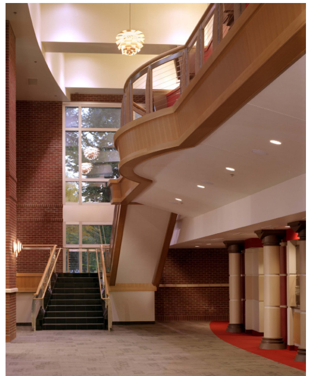
First floor lobby maintains an historic aesthetic in this newly renovated state-of-the-art building.