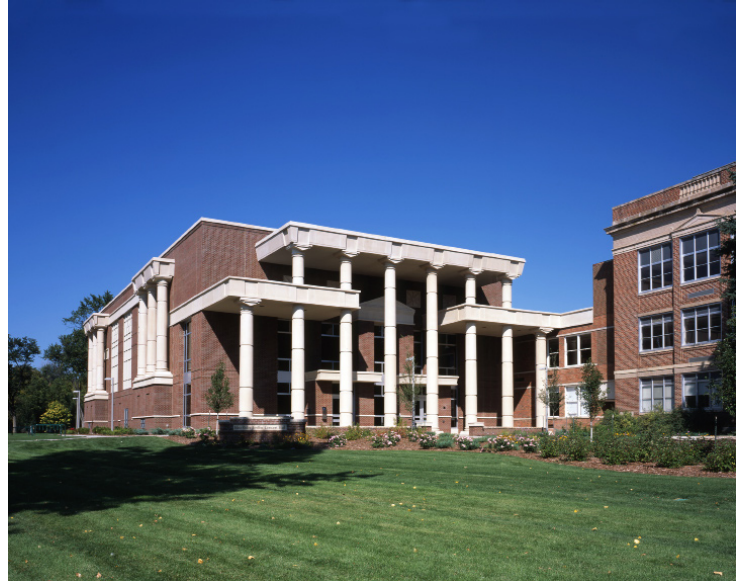
Exterior view of the Concert Hall at University Center for the Arts on Colorado State University's campus.